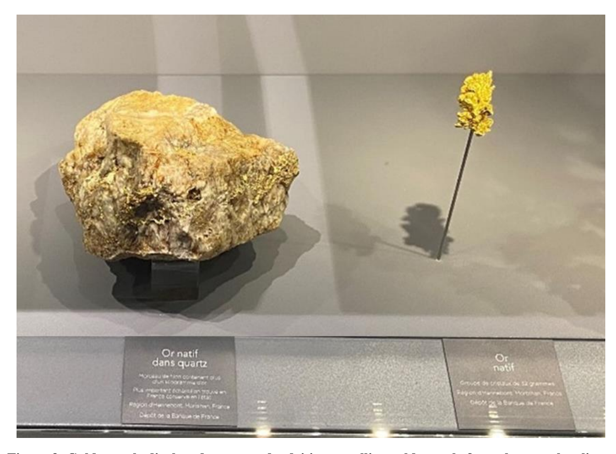
Figure 3: Gold sample displayed next to a dendritic crystalline gold sample from the same locality.