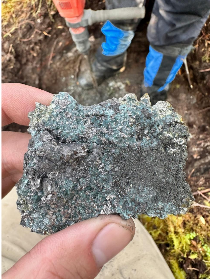
Figure 1. Grab sample 344465 showing intercumulate texture of pyrrhotite and/or pentlandite with chalcopyrite and silicate minerals.