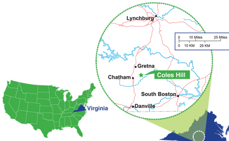
Figure 1: Coles Hill Property Location

put the deposit into production, but the project was shelved due to the drop in the price of uranium. At that time, a 5,000-ton per day open pit mine and mill was envisioned. The project lay dormant until 2007 when Virginia Uranium, Inc. drilled 12 holes to confirm the historic grades as part of the initial NI 43-101 technical report and mineral resource calculation. Development activities have ceased since late 2013. 2