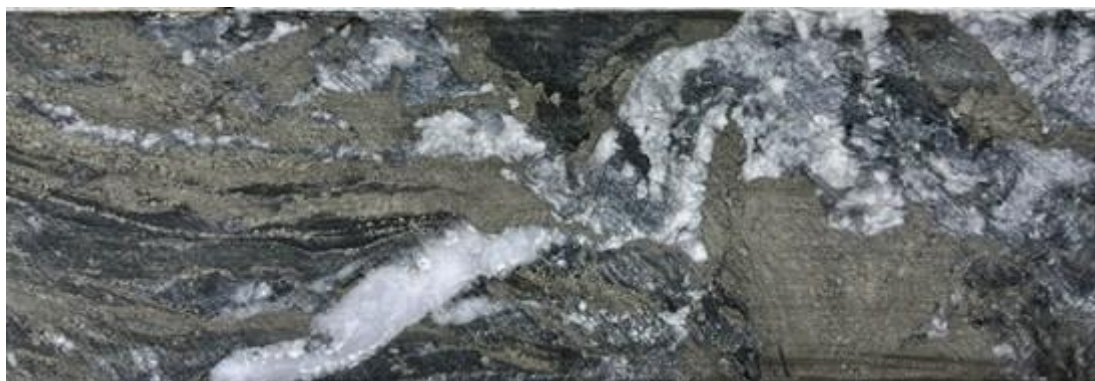
Plate 1: Semi-massive pyrite with iron-carbonate veinlets at 346.5 m downhole in drill hole EM-22-005 (#5 pierce point shown on Figure 1); mineralization extends from 346 to 363.5 m downhole. Assays are pending; NQ core (47.6mm diameter)

https://orders.newsfilecorp.com/files/3077/121125_c391862974558a8e_001full.jpg