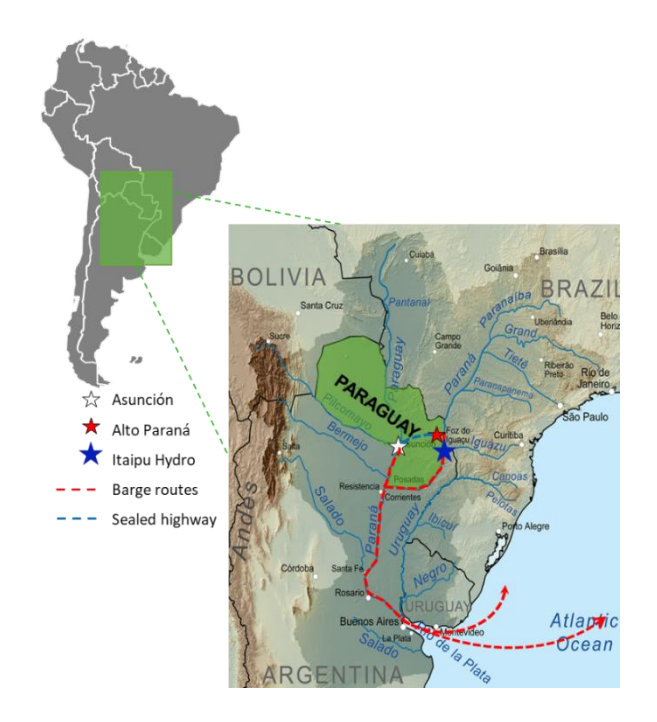
Figure 1 – UEC's Alto Paraná Titanium Project

$25 million was invested in the Project, including pilot testing from mining through to the smelting processes.