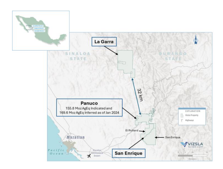
Figure 1: Location map of the San Enrique Prospect, Panuco Project and La Garra. See Company news release dated January 8, 2024 on "Updated Mineral Resource Estimate" for the Panuco project.