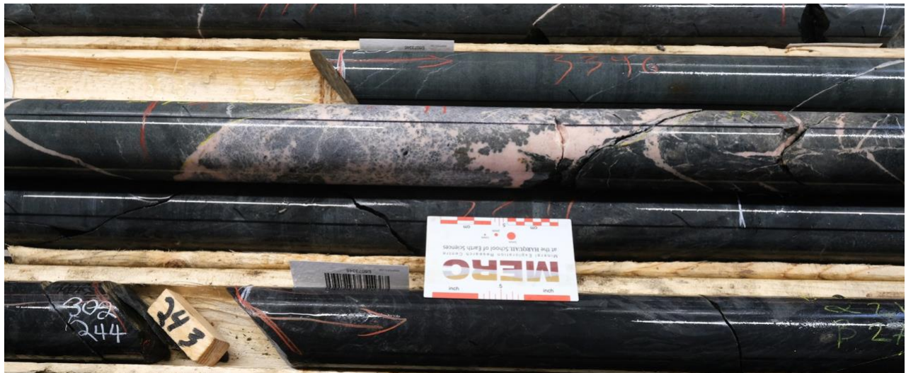
Figure 2: Distinctive Pinkish Dolomite Veins Are Known to Host Mineralization in the Cobalt Camp (scale card for reference)

Kuya Silver completed the initial 3,300 m drill program on the 100%-owned Kerr Project in June and is currently awaiting assay results. The strategy on the initial drill program for the Kerr Project is to systematically follow up on historical intersections of high-grade mineralized structures that have the potential to host significant tonnage. David Stein, Kuya Silver's President and CEO, stated, "At our newly defined North Drummond target, we intersected several mineralized veins, including a mineralized vein in hole 21-KERR-002 (see Figure 2) at a vertical depth of 140 m, with assay results pending. This intersection is located near FCC drillhole FCC-18-0093*, which intersected 2.2 metres of 515 g/t silver and 0.61% cobalt (including 0.7 metres of 1,460 g/t silver and 1.81% cobalt) from 172.1 m. This mineralized vein intersection in hole 21-KERR-002 is particularly encouraging, as it was following up on intersections to the north and away from the historic mine workings of the main Drummond Vein, and with potential to extend the structure vertically and laterally." (*Note: Individual assays were capped at 1500 g/t silver in hole FCC-18-0093)