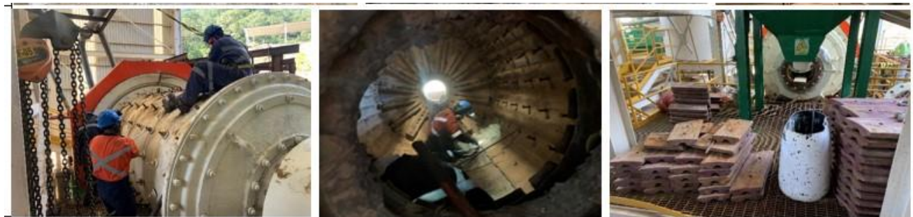
Figure 2: La Guitarra Ball Mills

All circuits in the processing plant are undergoing maintenance and rehabilitation work which would be required for the resumption of operations. In the grinding circuit, the three ball mills are being relined, all parts of the central drive shaft mechanisms overhauled, and the motors cleaned and tested. A fourth ball mill with limited capacity will not be rebuilt at this time.