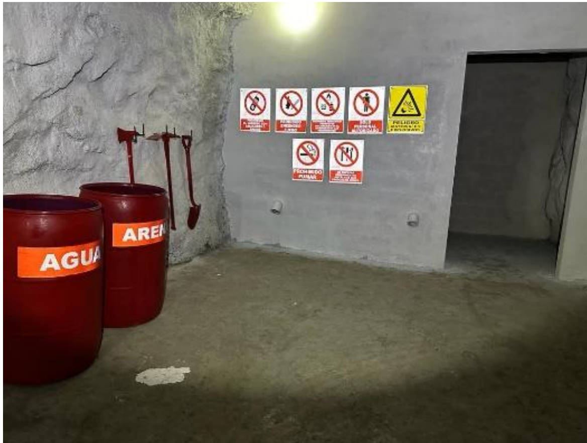
Figure 1: Underground Powder Magazine

safety and rock stability, cleaned and readied.